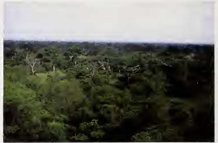
Fig. 1. View on Forêt de Lama, South Benin.

Lama Forest or Forêt de Lama is situated within a depression bearing the same name, 80 km north of Benin’s capital Cotonou (Figure 1). It is bordered in the north by the plateau of Abomey and in the south by the plateau of Alada. Lama Forest comprises a total area of 16.250 ha of “forêt classée”, 9.750 ha of which belong to the Département Atlantique (Sous-préfecture Toffo) and 6.500 ha belonging to the Département Zou (Sous-préfecture Zogbodomé) (Emrich et al. 1999). The center of this protected area – the protection status exists since 1947 – is formed by the Noyeau Central (4.777 ha) which is composed of primary forest (1.937 ha), degraded forest (1.388 ha) and of teak plantations and fallow grounds (together 1.452 ha) (Figure 2). The Noyeau Central is surrounded by ca 9.000 ha of forestry plantations. In earlier times, the primary forest covered the whole Lama depression which stretches over the south Benin in a west-east direction. Un-